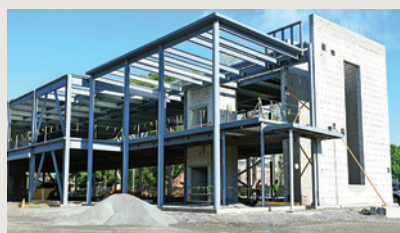
May 16, 2022