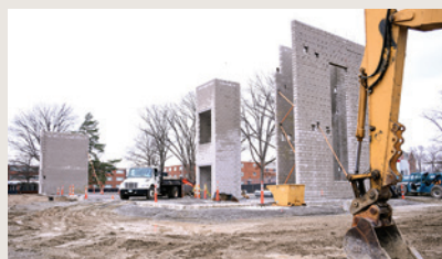
March 15, 2022