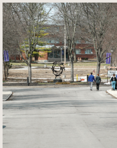
View down College Avenue March 17, 2022