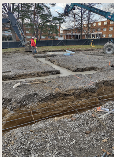
Foundation work Dec. 15, 2021